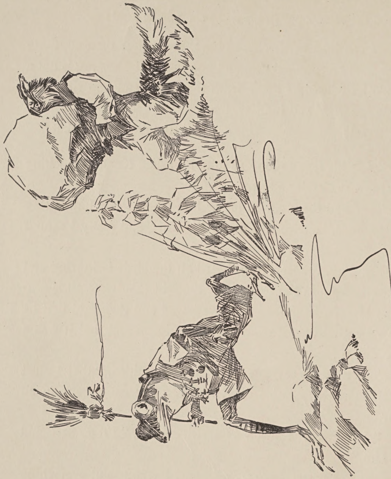
KERCHUG AND SLY FOX COME.